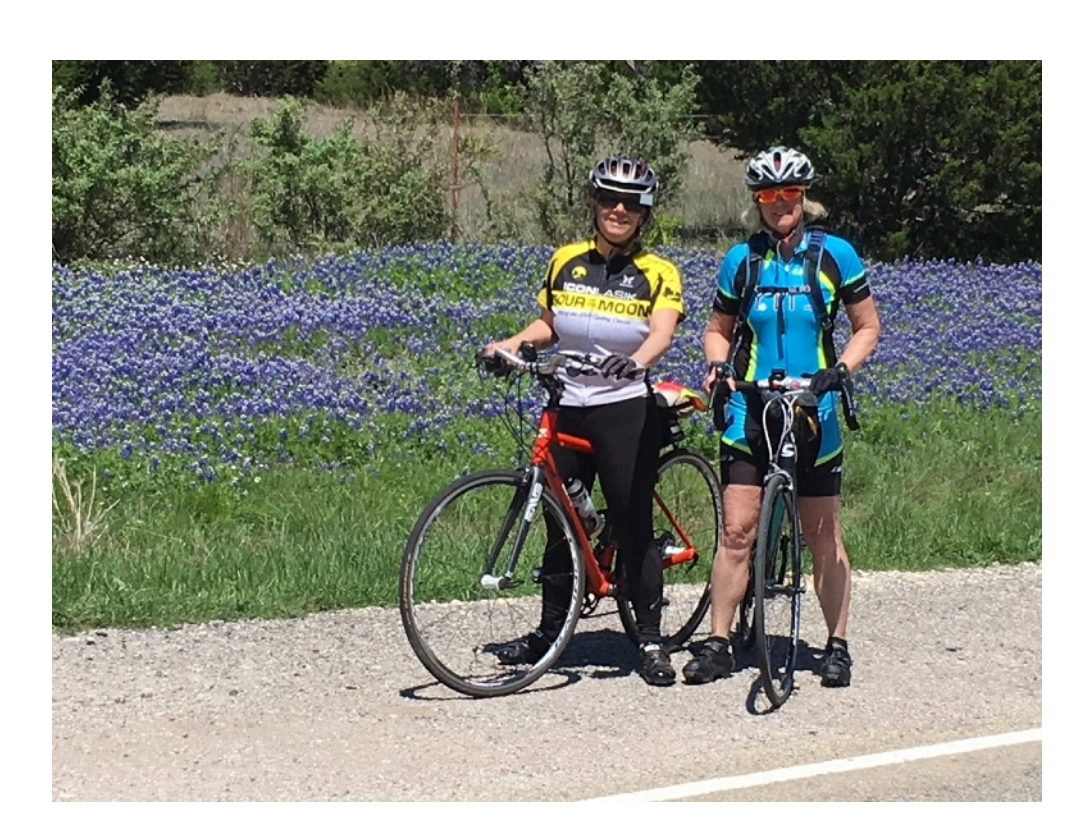
Day 1: Saturday, March 16 - Gypsum Mine, 34 miles, 1815 ft or 60 miles, 3160 ft. The Gypsum Mine Summit leads you to an actual Gypsum Mine with visual interest, if not beauty. That mile or so of road will be gypsum, not gravel!

Friday, March 15, Orientation meeting at 8pm